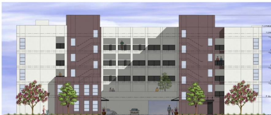
PROPOSED FRONT ELEVATION (FROM FOOTHILL BLVD)

Front (North): 5' Sides (East + West): ~6' Rear (South): 10'