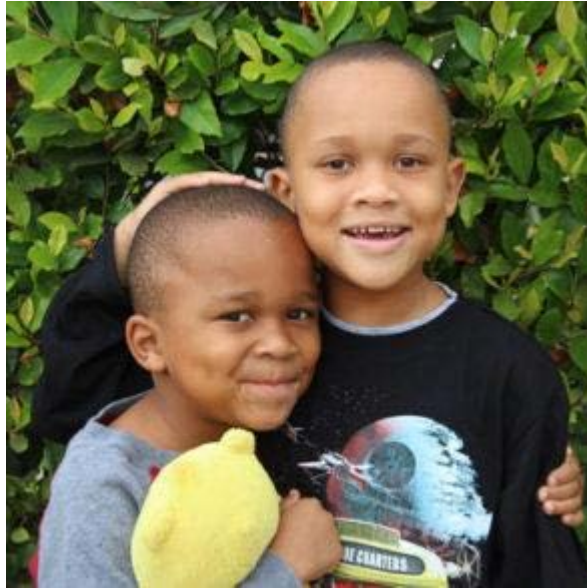
SHELTER / BRIDGE HOUSING