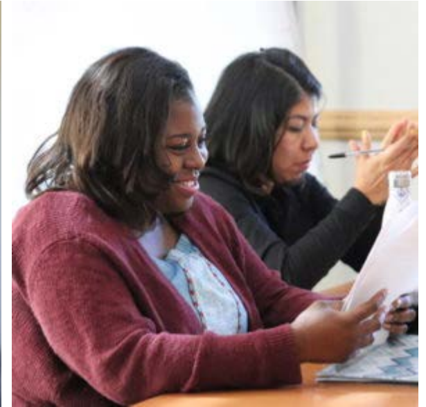
EMPLOYMENT & COMMUNITY INTEGRATION